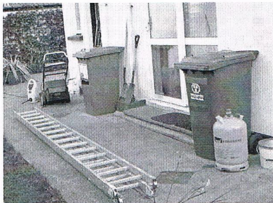
Too many items unsecured and left lying around